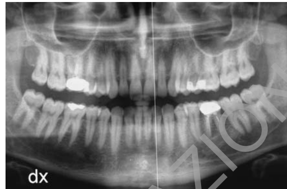
Figure 3 Panoramic Rx; it's possible to see the good level of the interproximal bone around 2.1, 2.2 and 2.3.