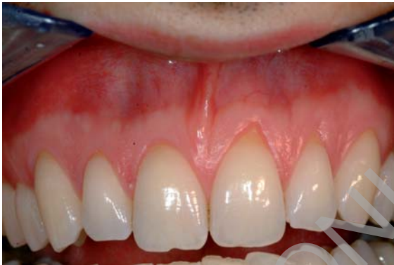
Figure 1 Multiple recessions on the elements 2.1, 2.2 respectively of mm 2, 3, ordered as 1 class of Miller.

Finally, we provided the patient with the essential postoperative indications in order to obtain a good recovery: we prescribed to the patient a non-steroidal anti-inflammatory, Brufen 600mg 1 every 8 hours and in case of need, we advise an appropriate home hygiene for his mouth (excluding the area surgically treated) and an antiseptic with 0,12% of clorexidina for 15 days, 2 times per day (Figs. 10-13).