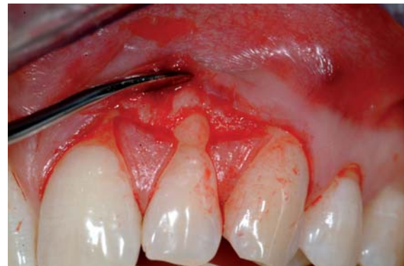
Figure 5 A full-thickness flap until the mucogingival junction without carrying out released cuts.