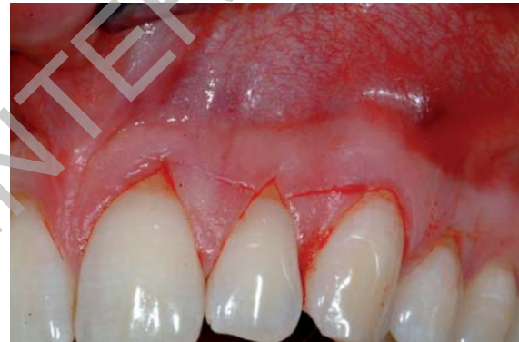
Figure 4 A partial-thickness dissection was raised starting from the line of enamel-cement of the adjacent teeth (2.1, 2.3) and convergent to the lateral incisor, drawing the new surgical papilla.