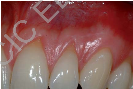
Figure 2 Vision of the recessions by a greater magnification.